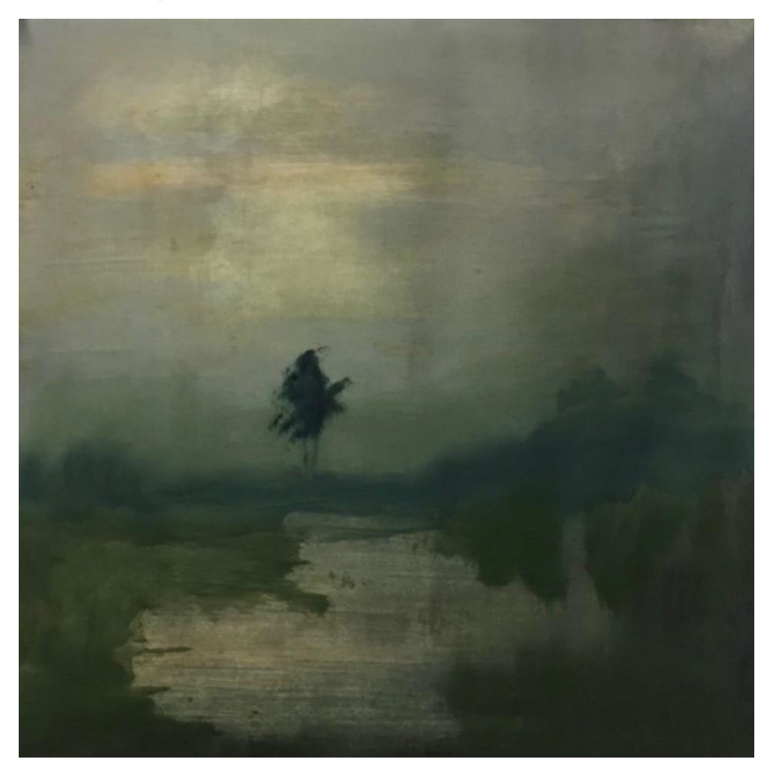
Morning Prayer Tenth Sunday after Pentecost